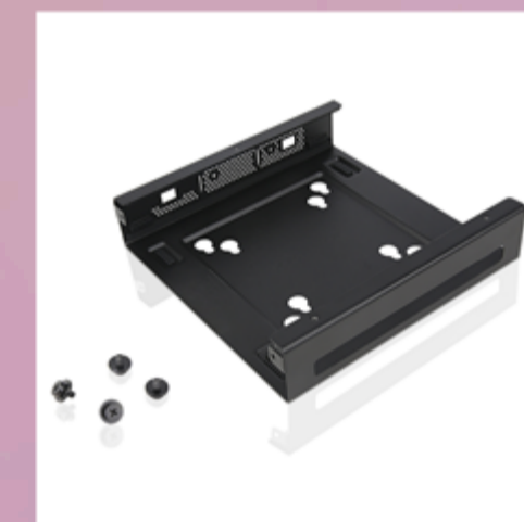
ThinkCentre Tiny VESA Mount II 4XF0N03161