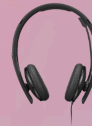
Lenovo Wired VoIP Headset (Teams) 4XD1M45626