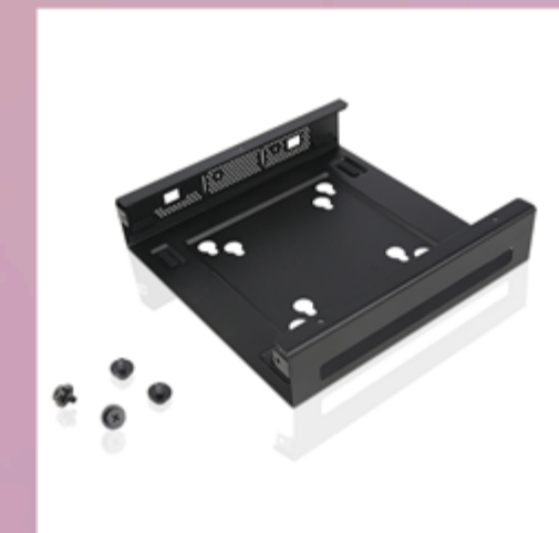
ThinkCentre Tiny VESA Mount II 4XF0N03161