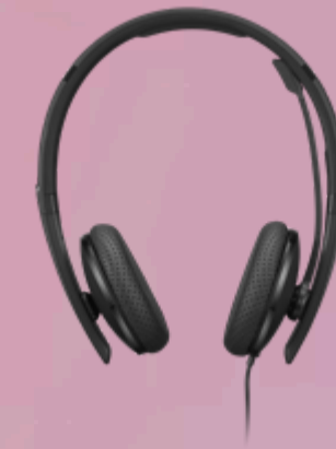
Lenovo Wired VoIP Headset (Teams) 4XD1M45626