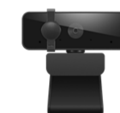
Lenovo 310 FHD Webcam Black GXC1S15024