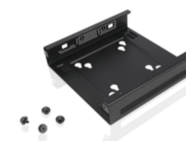
ThinkCentre Tiny VESA Mount II 4XF0N03161