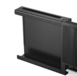
ThinkCentre Tiny Mounting Kit 4XF1R07369