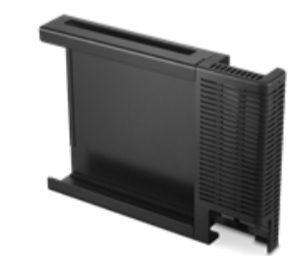
ThinkCentre Tiny Mounting Kit 4XF1R07369