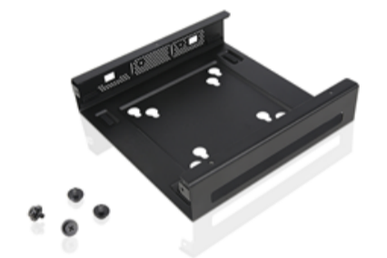
ThinkCentre Tiny VESA Mount II 4XF0N03161