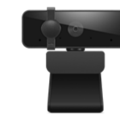
Lenovo 310 FHD Webcam Black GXC1S15024