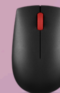
Lenovo Essential Compact Wireless Mouse 4Y50R20864