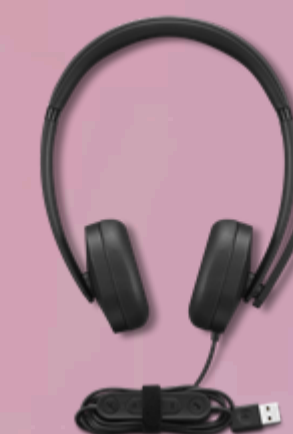
Lenovo USB-A Wired Stereo Headset Gen 2 4XD1P83425