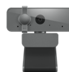
Lenovo Select FHD Webcam Gen2 GXC1S15023