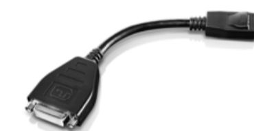
DisplayPort to Single-Link DVI-D (Digital) Monitor Adapter Cable II 4X91W44833