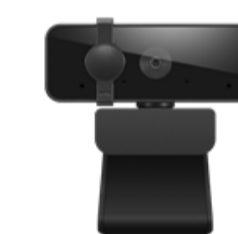
Lenovo 310 FHD Webcam Black GXC1S15024