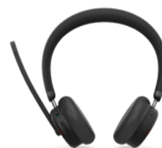
Lenovo Dual-Mode Wireless ANC Headset 6550 (USB-C, Teams) 4XD1S19778