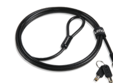
Kensington MicroSaver DS 2.0 Cable Lock from Lenovo 4XE1L68273