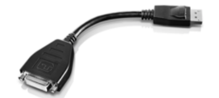
DisplayPort to Single-Link DVI-D (Digital) Monitor Adapter Cable II 4X91W44833