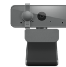
Lenovo Select FHD Webcam Gen2 GXC1S15023