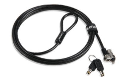
Kensington MicroSaver DS 2.0 Cable Lock from Lenovo 4XE1L68273