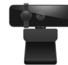
Lenovo 310 FHD Webcam Black GXC1S15024