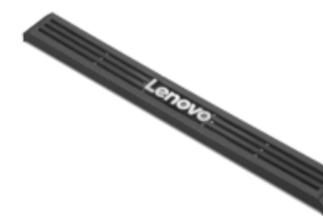
ThinkCentre Tiny Dust Shield Gen6 4XH1U87485