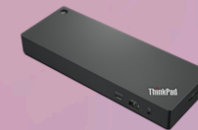
ThinkPad Universal Thunderbolt 4 Dock - Italy/Chile 40B001351T