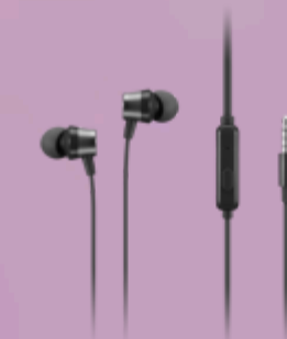
Lenovo Analog In-Ear Headphones Gen II Bulk Package (20pcs) 4XD1T54899

Please click here to view the full list of accessories.