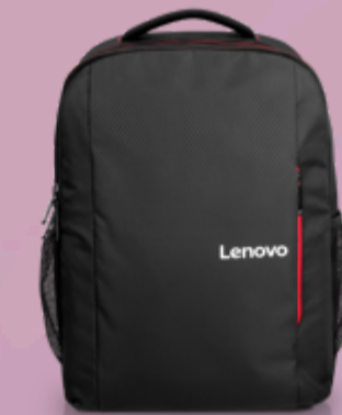
Lenovo 15.6 Laptop Everyday Backpack B510-ROW 4X41U80414