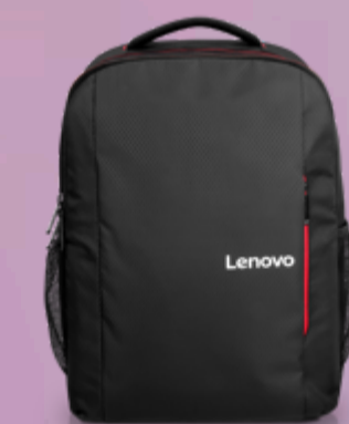
Lenovo 15.6 Laptop Everyday Backpack B510-ROW 4X41U80414

Please click here to view the full list of accessories.