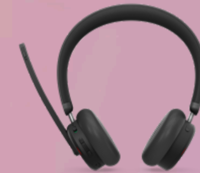
Lenovo Dual-Mode Wireless ANC Headset 6550 (USB-C, Teams) 4XD1S19778