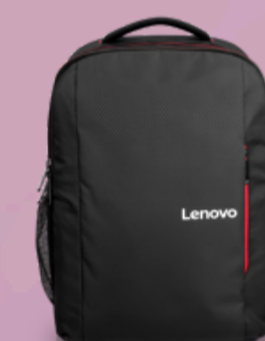
Lenovo 15.6 Laptop Everyday Backpack B510-ROW 4X41U80414