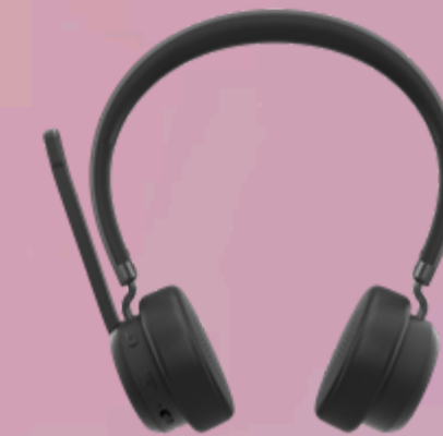
Lenovo Wireless VoIP Headset (Teams) 4XD1M80020