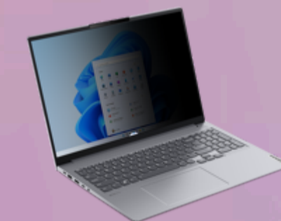
Lenovo 16-inch Premium Clarity Privacy Filter for P16/T16 Gen1 (16:10) 4XJ1U03940

Please click here to view the full list of accessories.