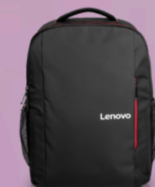
Lenovo 15.6 Laptop Everyday Backpack B510-ROW 4X41U80414

Please click here to view the full list of accessories.