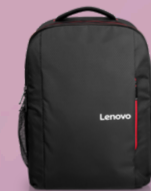
Lenovo 15.6 Laptop Everyday Backpack B510-ROW 4X41U80414