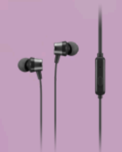
Lenovo Analog In-Ear Headphones Gen II Bulk Package (20pcs) 4XD1T54899

Please click here to view the full list of accessories.