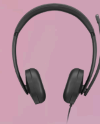
Lenovo Wired VoIP Headset 5000 4XD1R88995