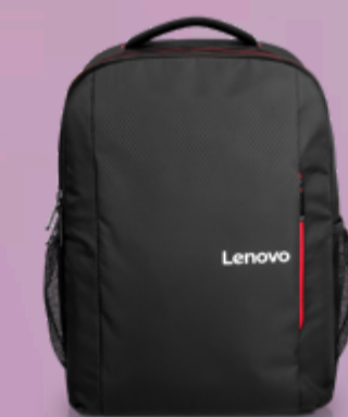
Lenovo 15.6 Laptop Everyday Backpack B510-ROW 4X41U80414

Please click here to view the full list of accessories.