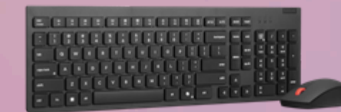
Lenovo Essential Wireless Combo Keyboard & Mouse Gen2 Black Italy 4X31R64473