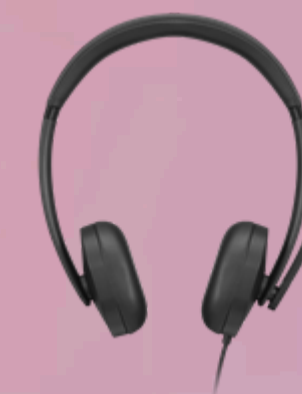
Lenovo Wired VoIP Headset 5000 4XD1R88995