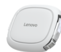
Lenovo 240W USB-C Retractable Cable