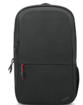
ThinkPad Essential 16-inch Backpack (Eco)