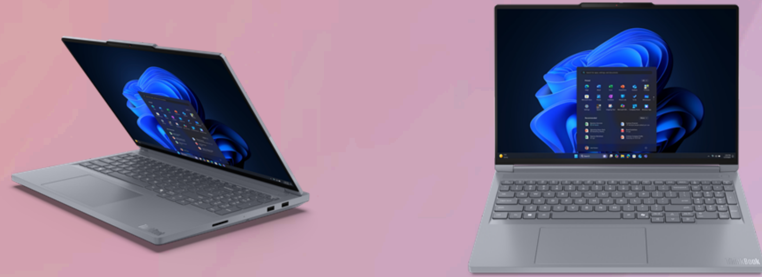
The product images are for illustration purposes only. Actual product appearance, ports, keyboard layout, and accessories may vary by model.