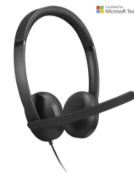
Lenovo Wired VoIP Headset 5000 (Teams)