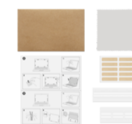
Lenovo 16" Clarity Privacy Filter