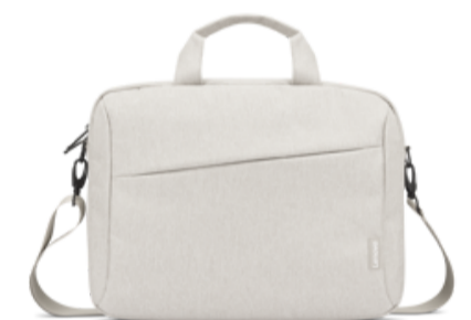
Lenovo 16" Laptop Topload T210 Beige (ECO)