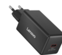
Lenovo 65W Mini USB-C GaN Charger