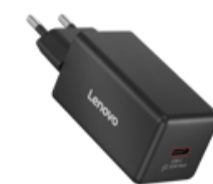
Lenovo 65W Mini USB-C GaN Charger GOA665WBEU