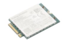
ThinkPad Rolling Wireless RW101R-GL SDX12 4G USB M.2 3042 module for CS2627 4XC1V64418