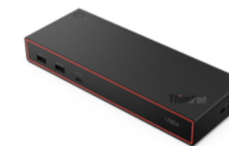
ThinkPad USB4 Dock 5000 (with 135W Adapter) 40BF0135IT