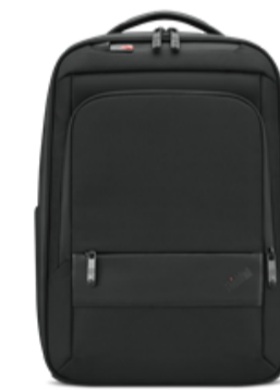
ThinkPad Professional 16-inch Backpack Gen 2 4X41M69794