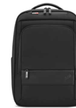
ThinkPad Professional 16-inch Backpack Gen 2 4X41M69794