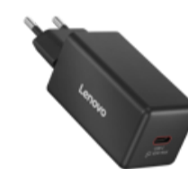
Lenovo 65W Mini USB-C GaN Charger GOA665WBEU