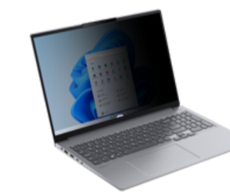
Lenovo 16" Clarity Privacy Filter 4XJ1U03940