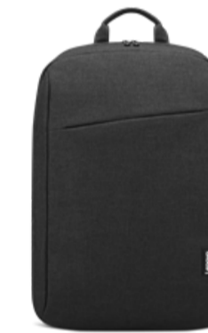
Lenovo 16-inch Laptop Backpack B210 Black(ECO) 4X40T84059