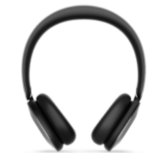
ThinkPad Dual-Mode Wireless ANC Foldable Headset 8550 (Aura Edition) - USB-A,... 4XD1V23301