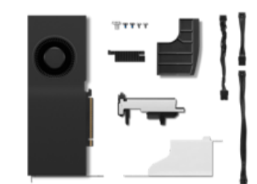
NVIDIA RTX PRO 4500 Blackwell 32GB DP*4 GDDR7 Graphics Card