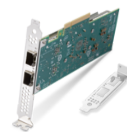
Intel E810-DA2 10/25GbE SFP28 2-Port PCIe Ethernet Adapter