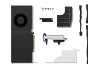
NVIDIA RTX PRO 4500 Blackwell 32GB DP*4 GDDR7 Graphics Card