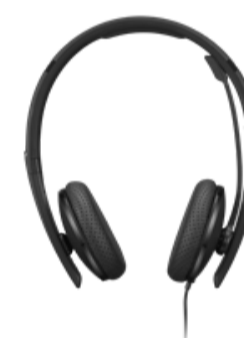
Lenovo Wired VoIP Headset (Teams)