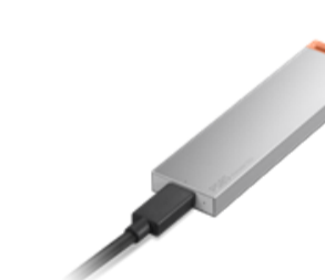
Lenovo PS8S Portable SSD 4TB