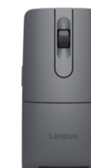
ThinkPad Bluetooth Presenter Mouse (Aura Edition)