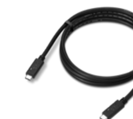
Lenovo USB 20Gbps USB-C to USB-C Cable 1.5m