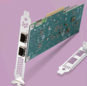
Intel E810-DA2 10/25GbE SFP28 2-Port PCIe Ethernet Adapter 4XC1U87489

Please click here to view the full list of accessories.