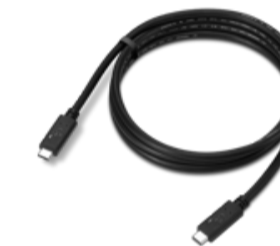
Lenovo USB 20Gbps USB-C to USB-C Cable 1.5m