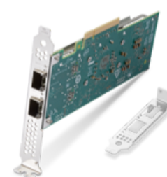
Intel E810-DA2 10/25GbE SFP28 2-Port PCIe Ethernet Adapter