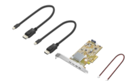
ThinkStation USB4 Dual Port PCIe Card