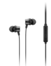
Lenovo Analog In-Ear Headphones Gen II Bulk Package (20pcs)