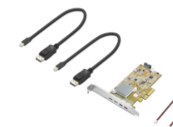
ThinkStation USB4 Dual Port PCIe Card