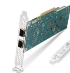
Intel E810-DA2 10/25GbE SFP28 2-Port PCIe Ethernet Adapter