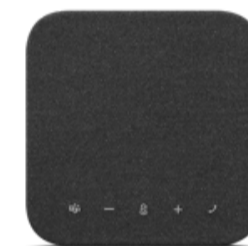
Lenovo Wireless Speakerphone 6000