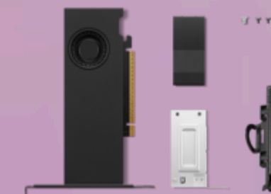
NVIDIA RTX PRO 2000 Blackwell 16GB mini DP*4 GDDR7 Graphics Card 4X61T95638

Please click here to view the full list of accessories.