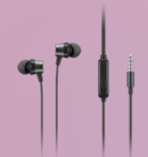
Lenovo Analog In-Ear Headphones Gen II Bulk Package 4XD1T54899

Please click here to view the full list of accessories.