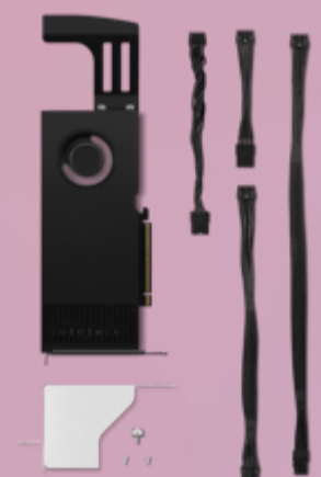
NVIDIA RTX PRO 4000 Blackwell 24GB DP*4 GDDR7 4X61T95636