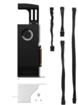
NVIDIA RTX PRO 4000 Blackwell 24GB DP*4 GDDR7 Graphics Card