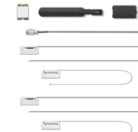
Intel Wi-Fi 7 BE200 WLAN Module