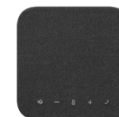
Lenovo Wireless Speakerphone 6000