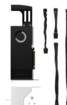
NVIDIA RTX PRO 4000 Blackwell 24GB DP*4 GDDR7 Graphics Card