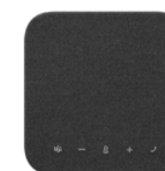
Lenovo Wireless Speakerphone 6000