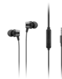
Lenovo Analog In-Ear Headphones Gen II Bulk Package (20pcs)