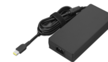
ThinkStation Slim 330W AC Adapter (Slim tip)-IT