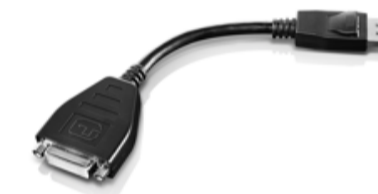
DisplayPort to Single-Link DVI-D (Digital) Monitor Adapter Cable II 4X91W44833