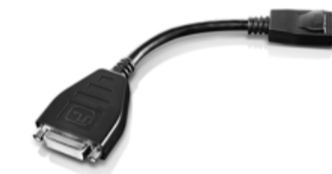
DisplayPort to Single-Link DVI-D (Digital) Monitor Adapter Cable II 4X91W44833