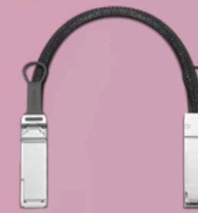
ThinkStation PGX QSFP Link Cable 4X91U42988