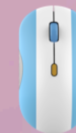
Lenovo 350 Bluetooth Silent Mouse (Fan Edition - Argentina) GY51U71763