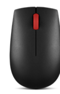
Lenovo Essential Compact Wireless Mouse