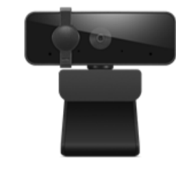
Lenovo 310 FHD Webcam Black