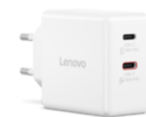
Lenovo Dual USB-C 65W GaN Charger