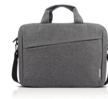
Lenovo 15.6-inch Laptop Casual Toploader T210 Grey