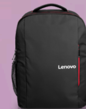
Lenovo 15.6 Laptop Everyday Backpack B510-ROW 4X41U80414

Please click here to view the full list of accessories.