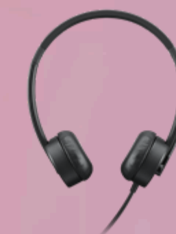
Lenovo Essential Stereo Analog Headset 4XD0K25030