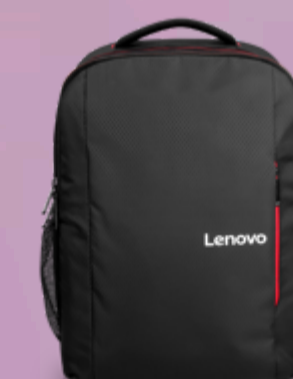
Lenovo 15.6 Laptop Everyday Backpack B510-ROW 4X41U80414

Please click here to view the full list of accessories.