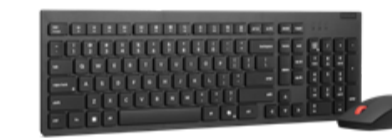
Lenovo Essential Wireless Combo Keyboard & Mouse Gen2 Black-Italy