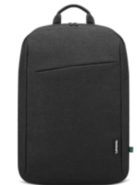
Lenovo 16-inch Laptop Backpack B210 Black(ECO)