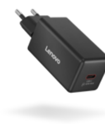
Lenovo 65W Mini USB-C GaN Charger