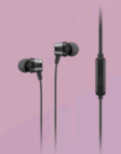
Lenovo Analog In-Ear Headphones Gen II Bulk Package (20pcs) 4XD1T54899