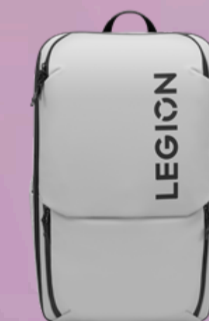
Lenovo Legion 17" Gaming Backpack GB800 (Light Gray) GX41U39300

Please click here to view the full list of accessories.